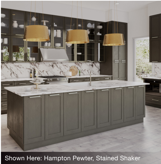
Shown Here: Hampton Pewter, Stained Shaker